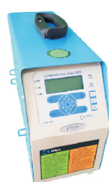
Combine PUC Machine