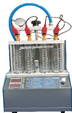
2w / 4w Injector Cleaner