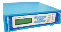
Petrol PUC Machine