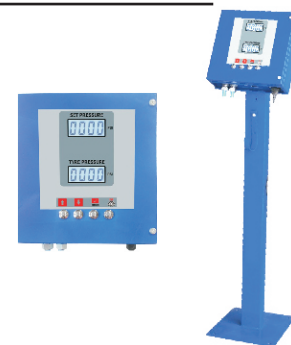
Digital Air Inflator